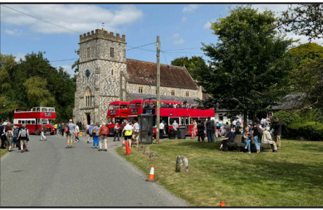
Pictures from top: "And then five come along"; Anyone for afternoon tea?; We Brits still lead the world in orderly queuing; All change now; One of this summer's few open-top days.