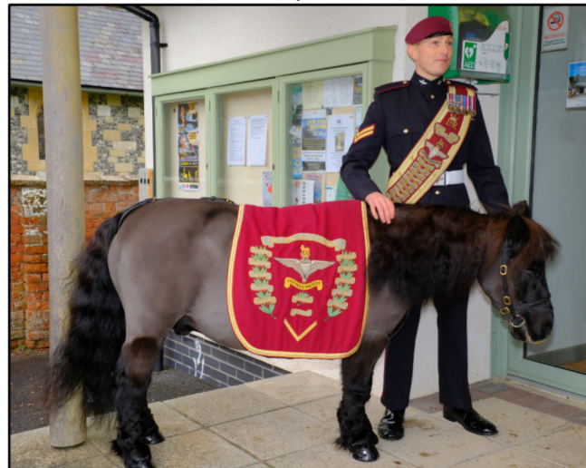
Never work with children or animals! - Pegasus the Shetland Pony, mascot to the Parachute Regiment did his best to steal the show!