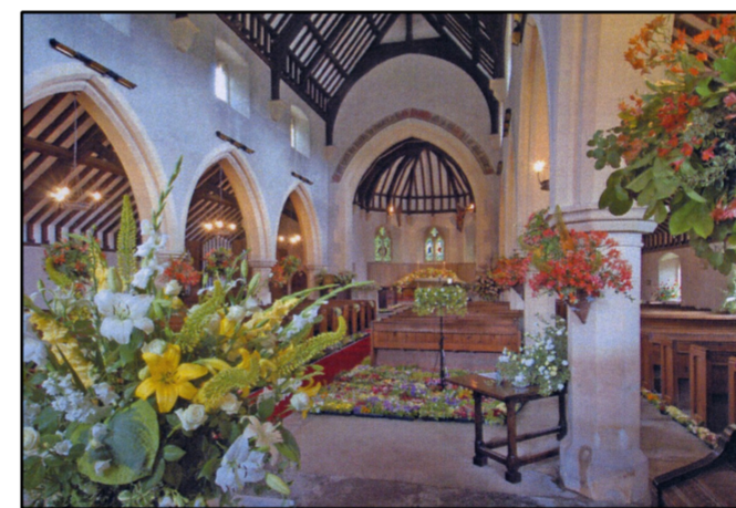
It sometimes pays to look back! Barry.

Indeed, just two years later this photo (below) of the interior of the church during the annual Flower Festival appeared, interestingly, at the same time that we were able to announce that Chitterne had won 1st place in the 'Small Village' class of the Best Kept Village competition - an ambition that some villagers are keen to repeat next year.