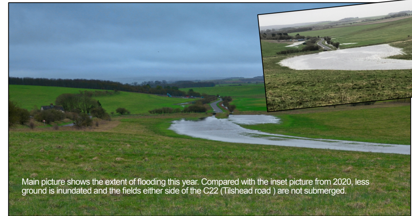
Main picture shows the extent of flooding this year. Compared with the inset picture from 2020, less ground is inundated and the fields either side of the C22 (Tilshead road) are not submerged.

It often comes as a surprise to people that Salisbury Plain, with an average elevation above sea level of over 100 metres, is an area of flood risk. However, as many Chitterne residents are only too aware, flooding is an annual risk to several households in the village.